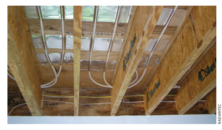
Radiant floor systems are relatively easy to install in buildings with unfinished basements offering easy access to the underside of the main-level floor.