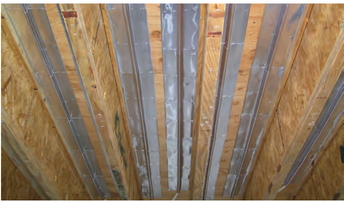
Aluminum heat-emission plates, like the homemade plates shown above, are sized to fit between floor joists. One or two grooves bent into the flat plate accommodate pex tubing.

of heat. Modern radiant floor heating systems can operate at much lower temperatures than traditional hydronic heating systems — typically around 100°F (38°C) — because the radiators are very large, in this case the whole floor of the building. This is the critical point when relating to solar heating because solar heating systems typically operate at relatively low temperatures. It is common to see solar storage tanks operate within the 100°F to 150°F range (38°C to 66°C), while traditional baseboard heating systems typically operate at 180°F (82°C).