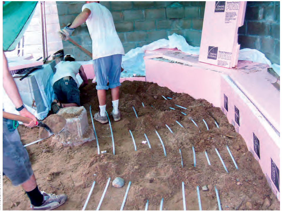
In high-mass solar heating systems, a sand bed typically 2 feet (61 cm) deep covers the building's entire footprint. A gridwork of pex tubing is installed in the sand bed, with solar-heated fluid pumped through. A concrete slab is poured over the compacted sand, and heat radiates through the floor and into the building.

(30- by 61-cm) aluminum plate with two strips of three-eighths-inch-thick plywood attached to the top side, covering the whole aluminum plate except for a three-eighths-inch-wide groove running the length of the piece. The track plates are attached to the top of the floor and aligned so the grooves create a long channel. The room's entire floor is covered with the track plates, creating a parallel grid of grooves. You'll snap pex tubing the same depth as the plywood into the grooves, creating a flat surface that can be covered with tile or hardwood. In a retrofit, installing track plates will require all doors and trim to be cut to accommodate the new floor height.